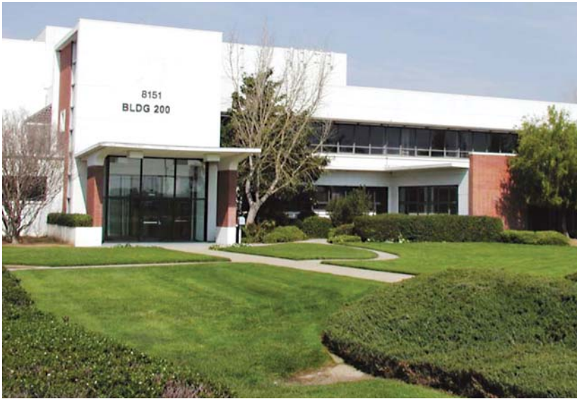
New Sacramento, California Facility